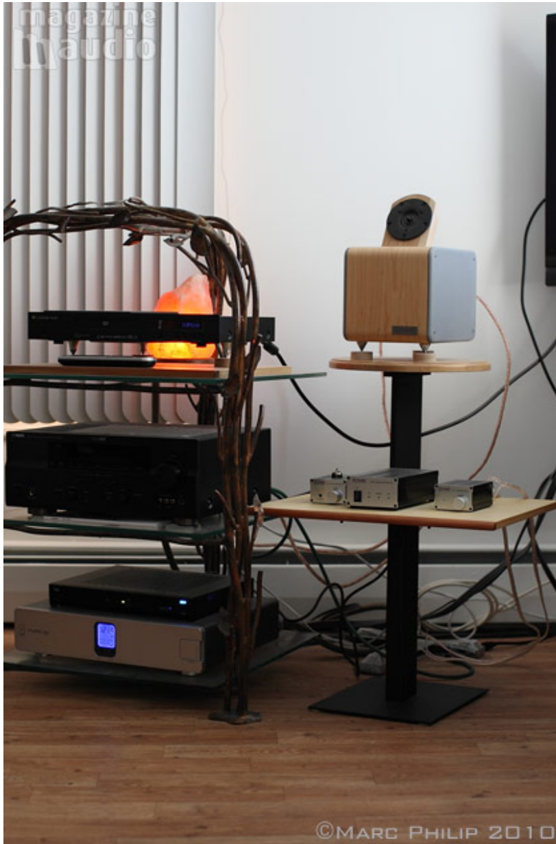
The iCombo associated Stereolith Audiophile 232