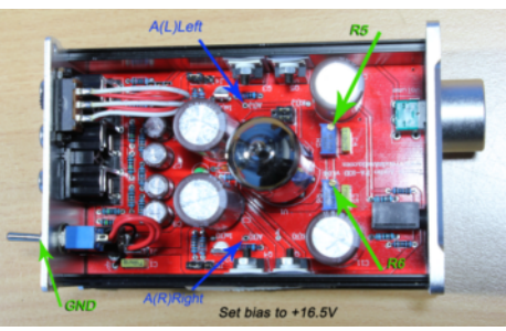
PA-10 (1 Output) Bias Setting